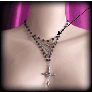
Colar - Necklace