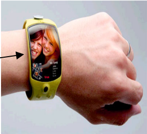
Relógio – Wrist Watch