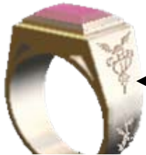
Anel - Ring