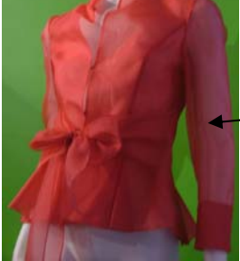
Blusa - Blouse