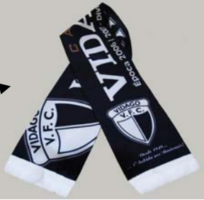
Cachecol - Scarf